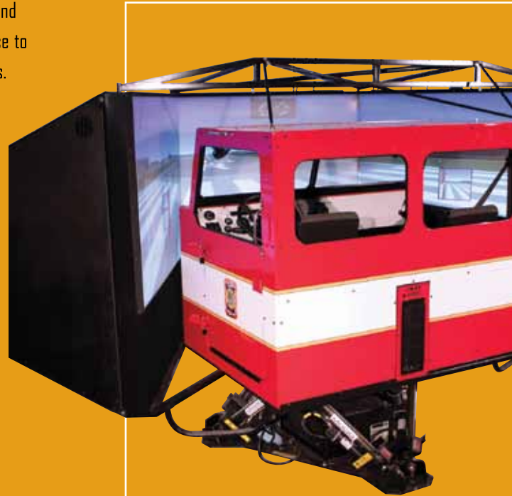
Simulator Driving Station