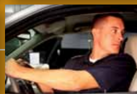
Geometrically correct 225° field of view