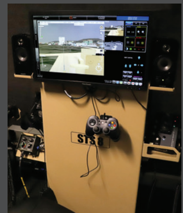
Vehicle Optics Sensor System (VOSS)