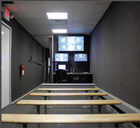
Instructor Operator Station (IOS), After Action Review Classroom